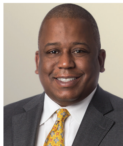
Kendrick Meeks Congressman Moderator